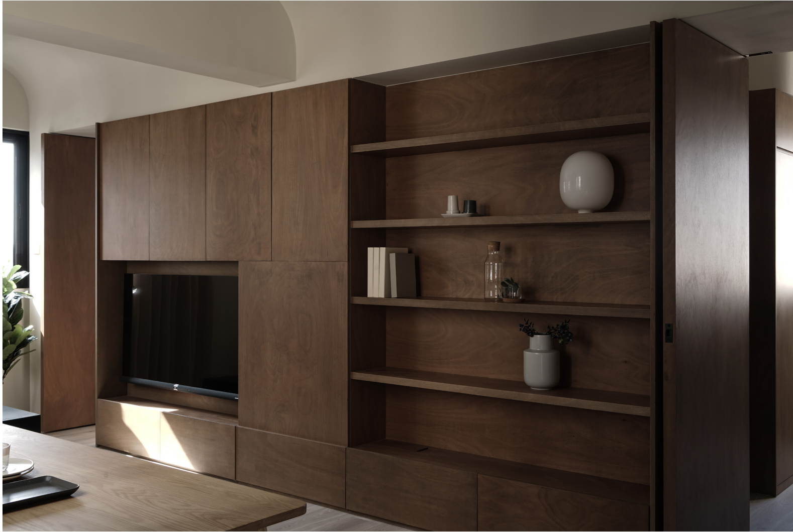
At the core of the residence is a large cabinet, designed to minimise visual clutter and perform as a room divider.