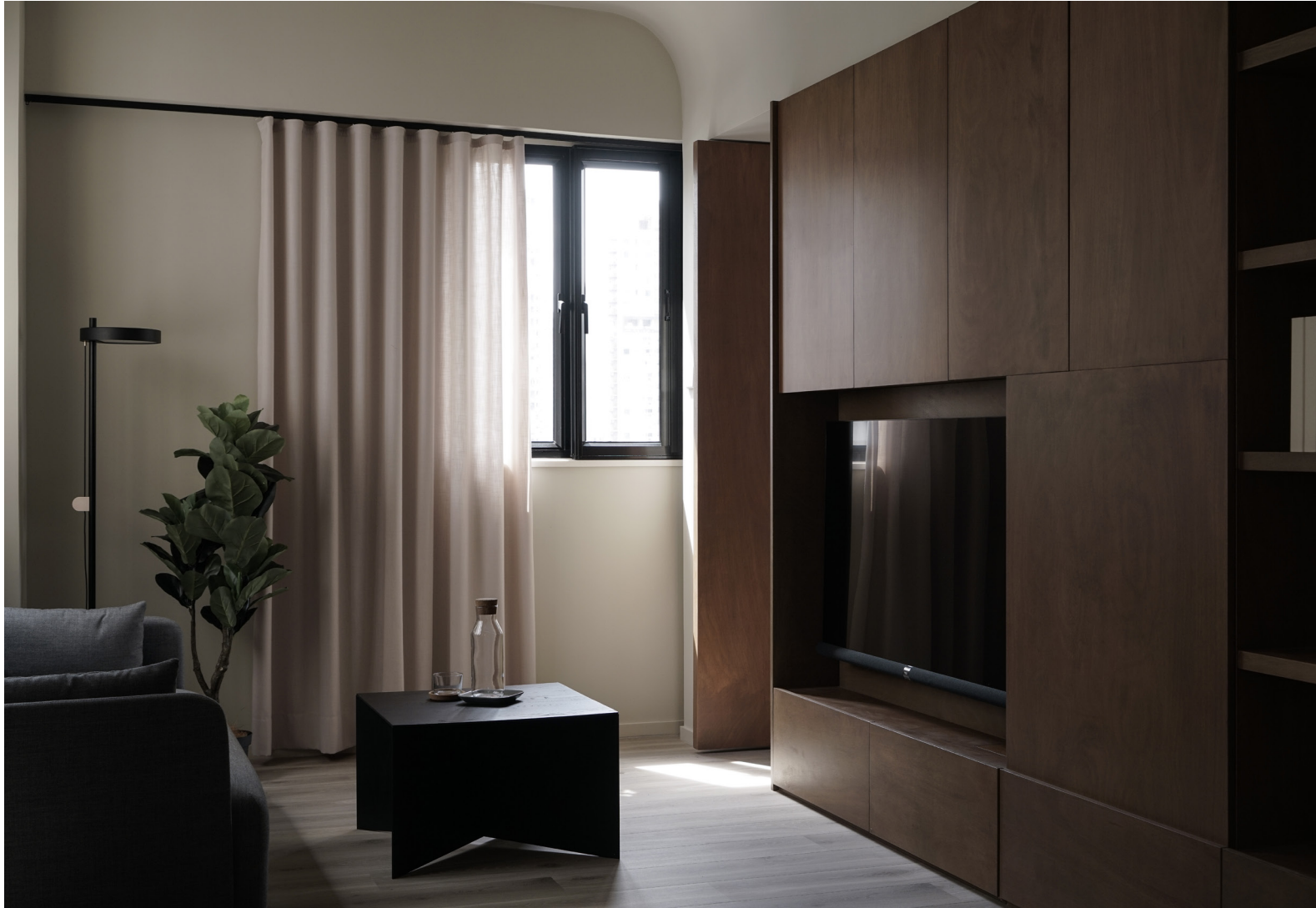
The WEXI Residence is a rich expression of the owner, filling the home with a curated selection of monochrome furnishings, including appearances from ALOT living, Menu, Ariake, and WUU.